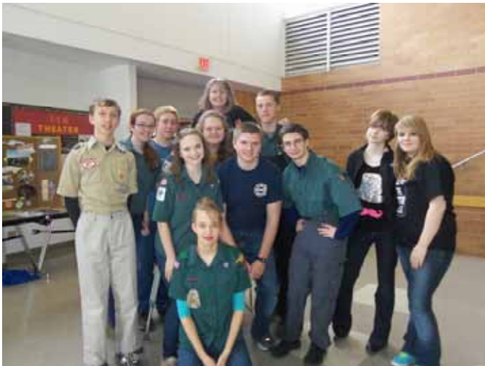
Venturers from several area Crews participated in Leadership Development Training at Prairielands Training College.